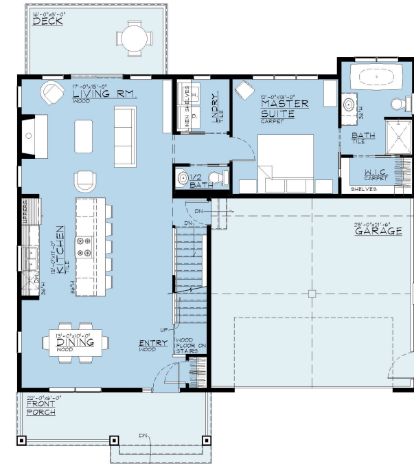
MAIN LEVEL PLAN

FINISHED AREA = 1,443 sq. ft. GARAGE AREA = 513 sq. ft. FRONT PORCH AREA = 132 sq. ft. DECK AREA = 180 sq. ft.